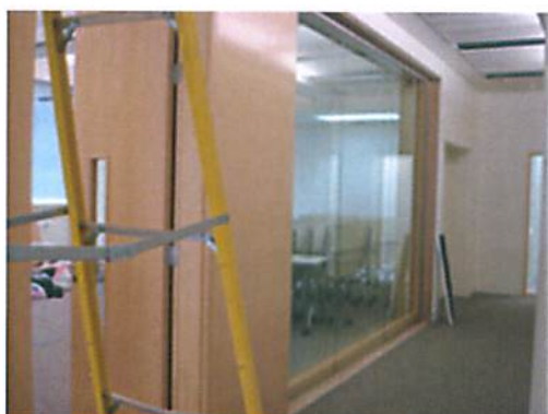
GENERAL VIEW OF GROUND FLOOR OFFICE TRIBUNAL ROOMS/OFFICES