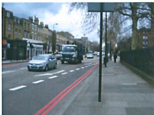
STREET SCENE LOOKING NORTH EAST