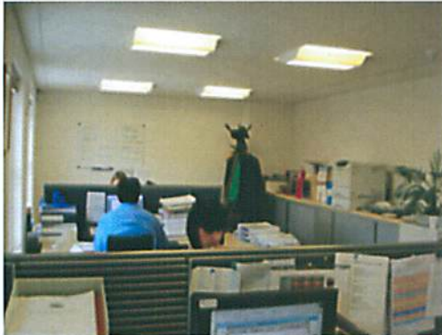
QUALITY OF OFFICE SPACE