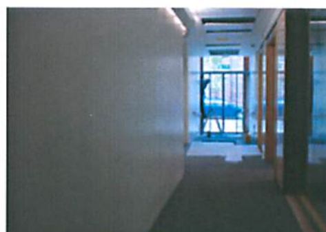
MAIN GROUND FLOOR CORRIDOR TO Nos. 22-26 STANNARY STREET LOOKING NORTH TOWARDS STANNARY STREET