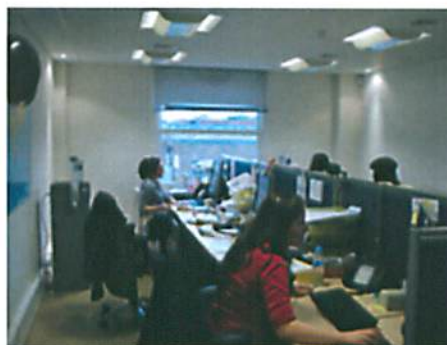
QUALITY OF OFFICE SPACE TO UPPER FLOORS OF NO. 184