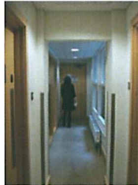
QUALITY OF CIRCULATION SPACE WITHIN BUILDING