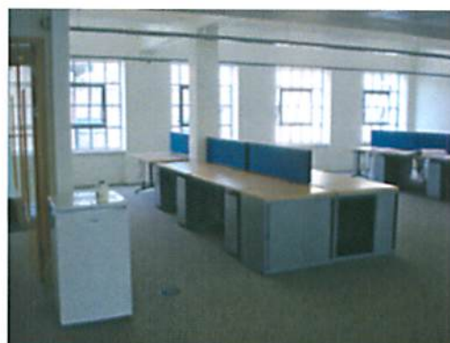
QUALITY OF FIRST FLOOR OFFICE SPACE