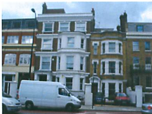
FRONT ELEVATION OF 184 KENNINGTON PARK ROAD LOOKING NORTH WEST (SUBJECT PROPERTY TO RIGHT HAND SIDE OF LAMP POST)