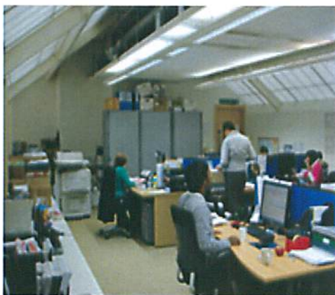
MEZZANINE OFFICE AREA