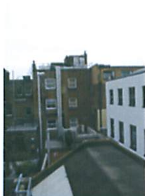
GENERAL ROOF LINE LOOKING EAST FROM NO. 20 STANNARY STREET