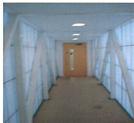
BRIDGE BETWEEN KENNINGTON PARK ROAD AND STANNARY STREET