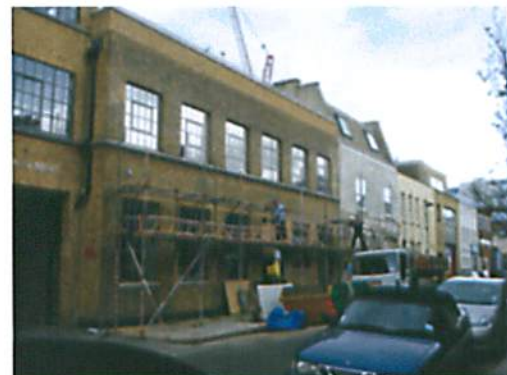
REAR ELEVATIONS TO NOS. 20 – 26 STANNARY STREET LOOKING SOUTH