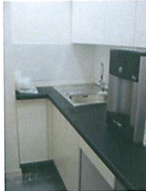
SMALL ANCILLARY KITCHENETTE TO FIRST FLOOR