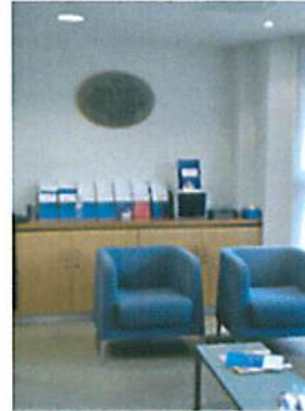
GROUND FLOOR RECEPTION AREA