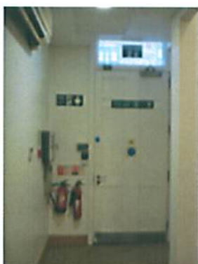
REAR ACCESS FROM STANNARY STREET INTO NO. 20 STANNARY STREET

184 KENNINGTON PARK ROAD, LONDON SE11 4BU 20 STANNARY STREET, LONDON SE11 4AA AND 22-26 STANNARY STREET, LONDON SE11 4AA