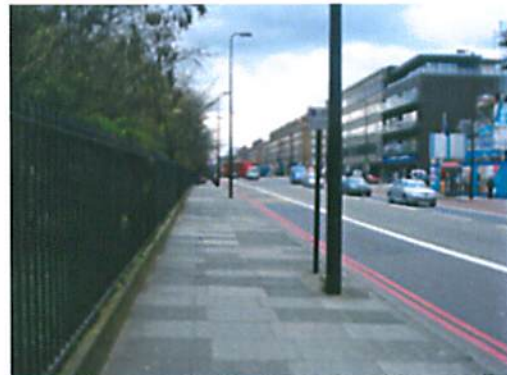
STREET SCENE LOOKING SOUTH WEST